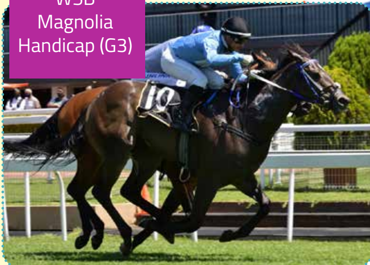
Sound Of Warning