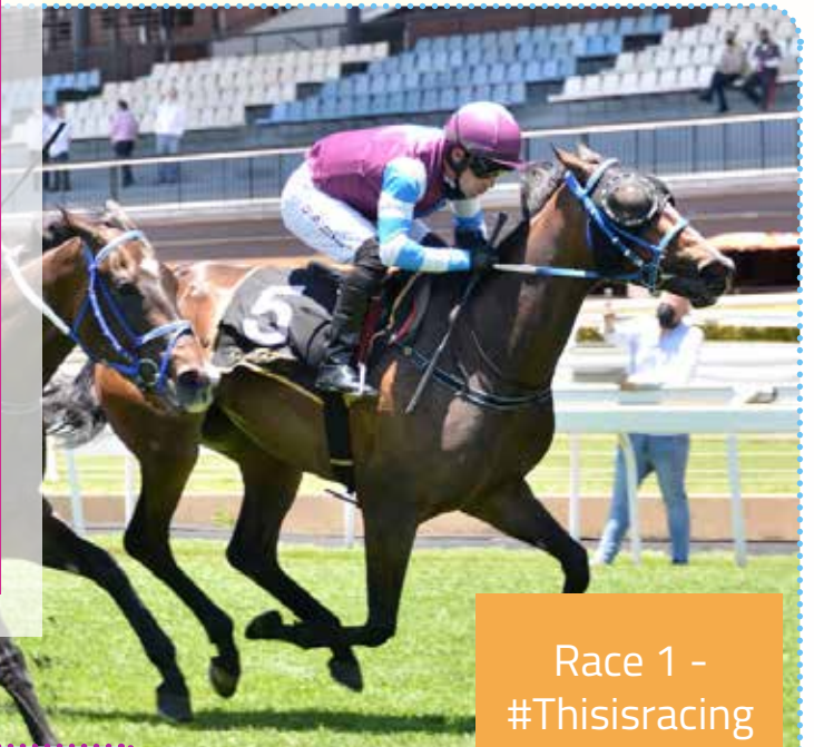
Race 1 - #Thisisracing Maiden Plate (F & M)