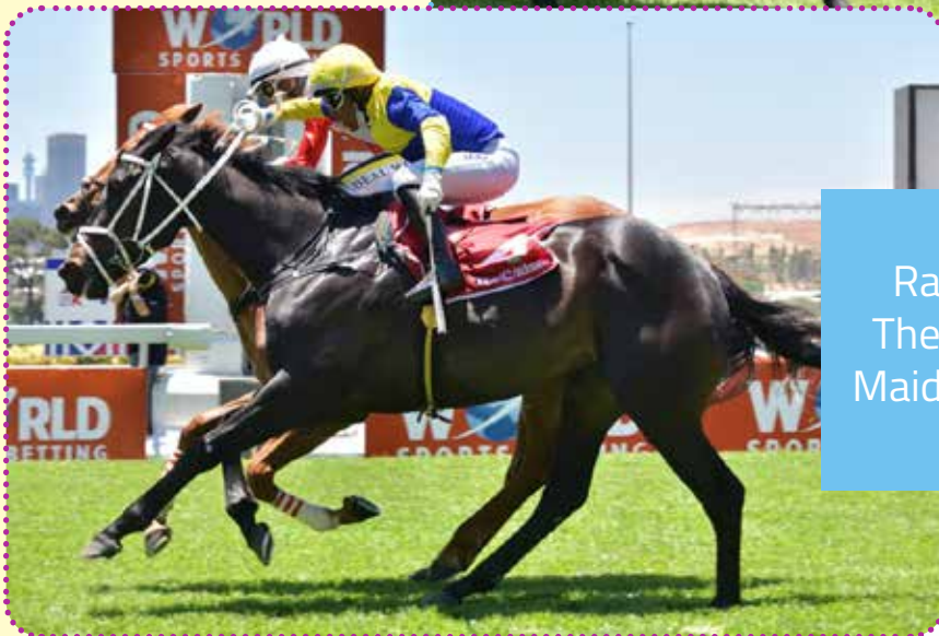
Race 2 – The Citizen Maiden Plate